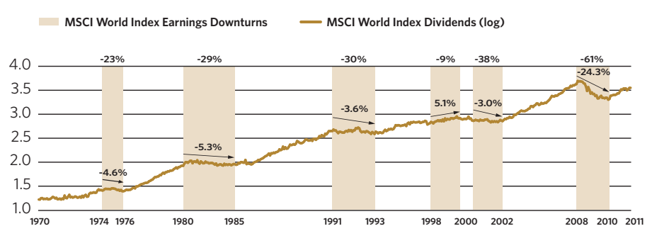
Exhibit 3 - Global Equity Dividends Remained Relatively Stable Despite Earnings Downturns

Corporate earnings and dividend distributions are not guaranteed and will fluctuate over time.