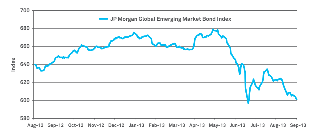
Figure 1: JP Morgan EMBI Total Return Index